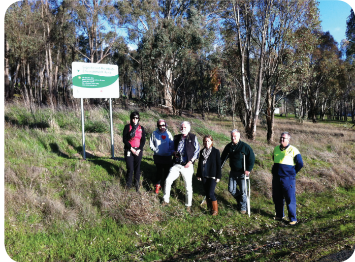
Members of the NSW Roadside Environment Committee inspecting roadside environmental management initiatives in the Tumut area

Details of recommended management actions for these areas and sites can be found in 'Managing Roadsides 3: Implementation'. Thus monitoring and evaluation should be related to: